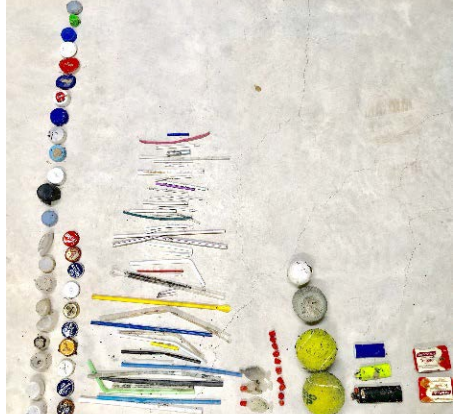
Figure 2: Arranging litter for interpretation