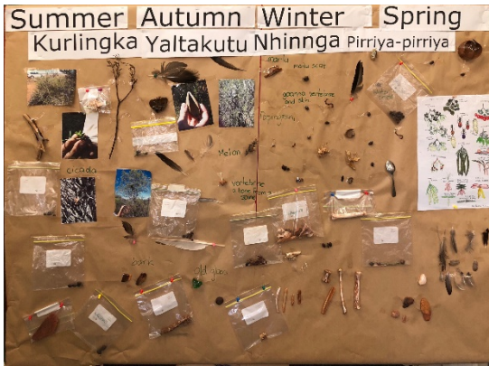
Figure 3: Leonora students sorted and classified data about the seasons in their local area.