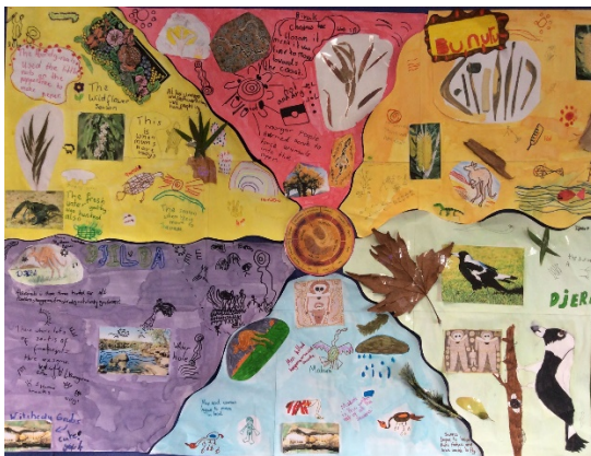
Figure 4: Noongar Aboriginal seasons expressed through data classification. Local plants and animals are represented in the season they are most plentiful.