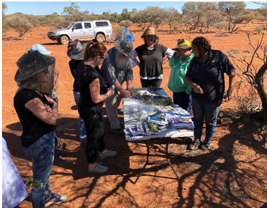
Figure 5: Two ACARA DTIF staff, teachers from Leonora District High School WA and Wangkatja Elders discuss ways to sort and categorise local plants.

In many of the classification systems of Aboriginal Peoples, organisms are grouped based on function and use. For example, the classification of wood-bearing plants may have the same name as the function of the finished object such as spear trees, string trees, shield trees, canoe trees or resin trees. In other function-based classifications, organisms may be placed in a group identified as material for use in the construction of tools or implements.