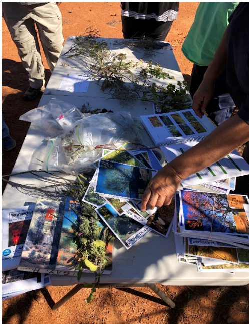
Figure 2: WA Wangkatja Elders discuss ways to sort and categorise local plants.

Aboriginal and Torres Strait Islander Histories and Cultures is a cross-curriculum priority in the Australian Curriculum. For each cross-curriculum priority, a set of organising ideas reflects the essential knowledge, understandings and skills for the priority.