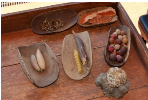
Figure 1: Australian bush foods and plants are collected and categorised by Aboriginal people according to their purpose.

Warning: Aboriginal and Torres Strait Islander readers are advised that this document may contain images and names of deceased persons.